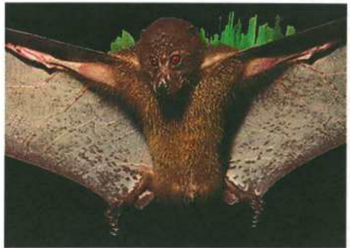
On page 13, read about the Lubee Bat Conservancy's Annual Bat Festival