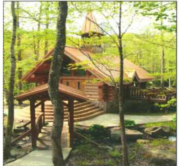
Almost Heaven Wedding Chapel www.almostheavenresort.com

I'm only a few keystrokes away by email at editor@plantcityguide.com .