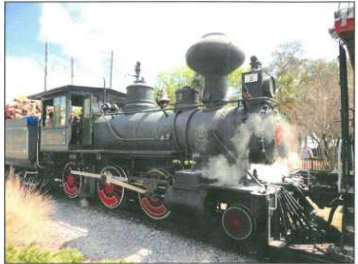
Orange Blossom Cannonball

Blood", "Rosewood" and "O Brother, Where Art Thou?" You will ride in the same coaches where famous stars such as Robert Redford, George Clooney, Patrick Swayze, Jodi Foster, Ed Harris, Renee Zellweger and Vigo Mortensen once posed. For more information, go to orangeblossomcannonball.com or call (352) 742-7200.