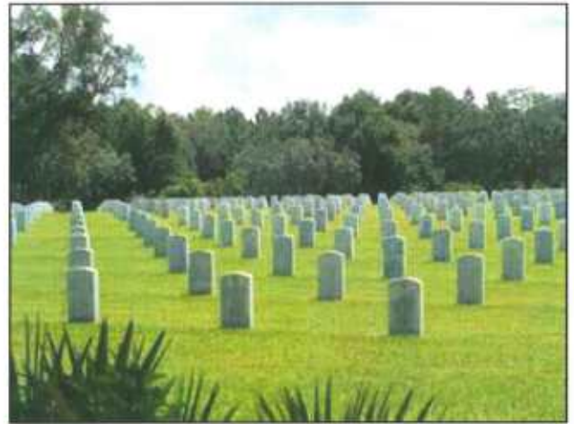
On page 8, read about Bill Histed's Latest Adventure to Bushnell National Cemetery

The Guide will continue to feature thought provoking opinion pieces, travel stories from both near and far, dining tidbits and inspiring stories that originate in the Plant City area. We also connect our readers with all there is to see and do in and around Plant City.