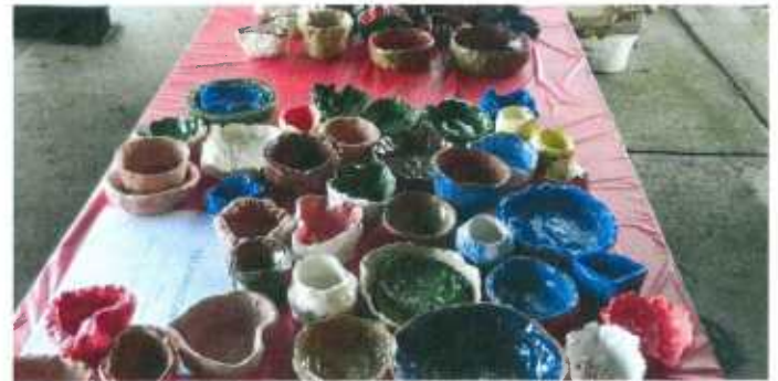
Bowls Donated by Local Students for Raffle

Now hiring an independent sales representative to contact local businesses for advertising. Earn good commissions plus bonuses. Must be a self-motivated person. Meet new people and learn about the business community in our area. A good way to earn money without having to commute out of town. Contact editor for more information.